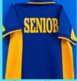
Senior Shirt $30.00

The uniform shop is open Monday to Friday from 8:15am - 11:30am and is situated in the Administration building.