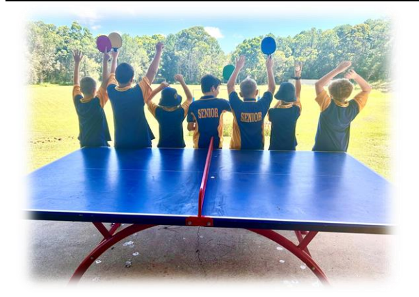
New table tennis