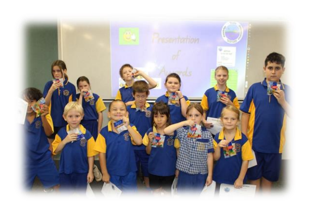
Attendance Awards – Every day counts!